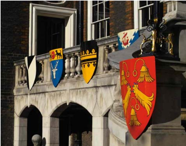
Shields of current officers of arms displayed on the steps and terrace of the College on 13 November, to mark the Lord Mayor's Show.